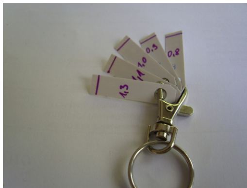
Fig. 2. Measuring ruler strips on a key chain for easy handling. Note that in Europe, a comma is commonly used instead of a decimal point. In this picture, the ruler is labeled with commas (eg, 1,3 IU rather than 1.3 IU).

For glargine, neither dilution nor mixing is recommended by the manufacturer and leads to formation of a cloudy precipitate in the syringe. However, human patients