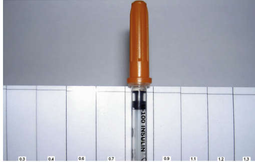
Fig. 1. An insulin syringe filled to 0.8 IU using an insulin syringe ruler. The ruler has been calibrated for BD Micro-Fine+ Demi 0.3-mL U-100 syringes (Becton Dickinson, Franklin Lakes, NJ), containing half unit markings, widely available in Germany, Switzerland, and Austria. The ruler is available for download at the following address: http://www.diabetes-katzen.net/insulinruler.pdf . Note that in Europe, a comma is commonly used instead of a decimal point. The syringes themselves are printed with 0,3 mL, and the packaging for the syringes is also labeled 0,3 mL.

Detemir is a relatively stable insulin and can be mixed with other shorter-acting insulin (eg, lispro or neutral protamine Hagedorn [NPH]). A special diluting medium is also available from Novo Nordisk; but in some countries (United States and Australia), the company will not supply veterinarians. Detemir can also be diluted with sterile water or saline (Shaun O'Mara, 2012 Novo Nordisk, personal communication). However, diluting with saline or water also dilutes the antimicrobial additive (metacresol). Therefore, because of the risk of bacterial contamination, it is recommended that the dilution be done just before the administration of insulin. Having said that, veterinarians in the past have previously diluted other insulin in the bottle and kept it refrigerated and discarded it in about 30 days. Based on experience with other insulin, with time, stability and action seemed to be adversely affected. Therefore, because of the risk of bacterial contamination and unknown changes in time with efficacy, diluting detemir in the bottle is not recommended.